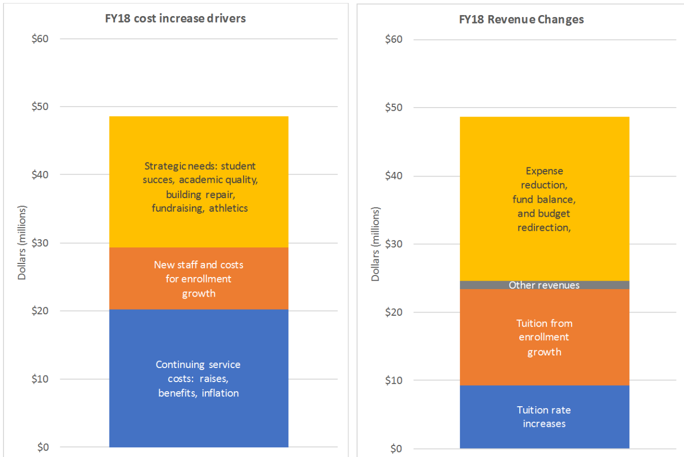
Figure 3: Distribution of principal expense components and revenue contributions for the Corvallis campus assuming Scenario B tuition rate changes of 4% for resident undergraduate and 2% for non-resident undergraduate.