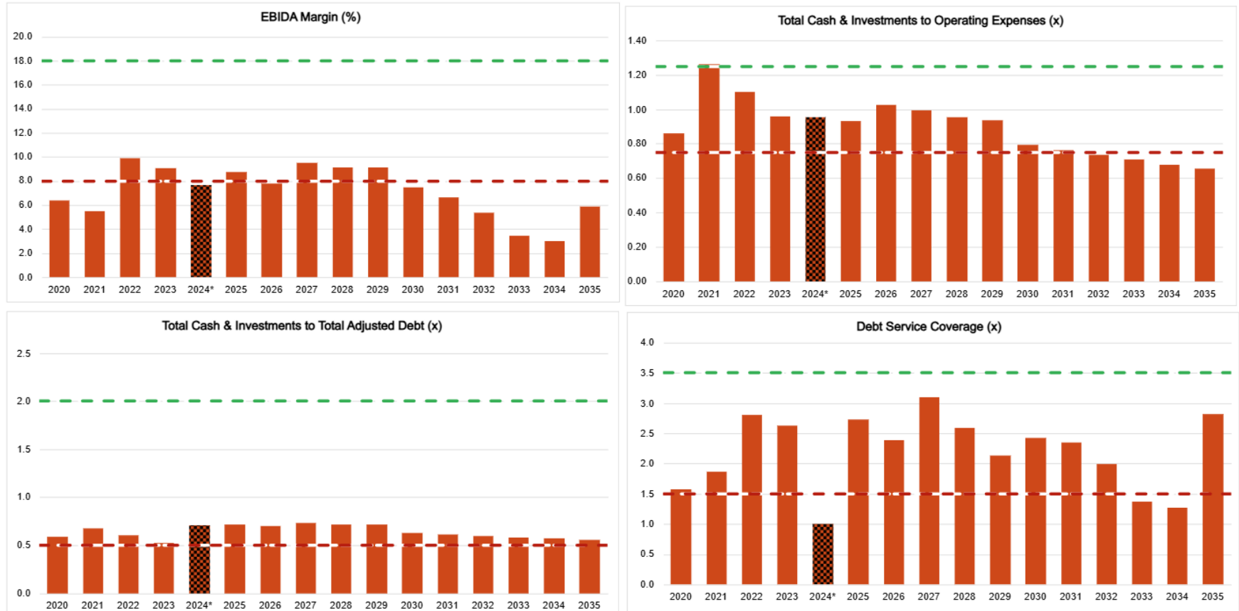
Table 2: Financial Metrics