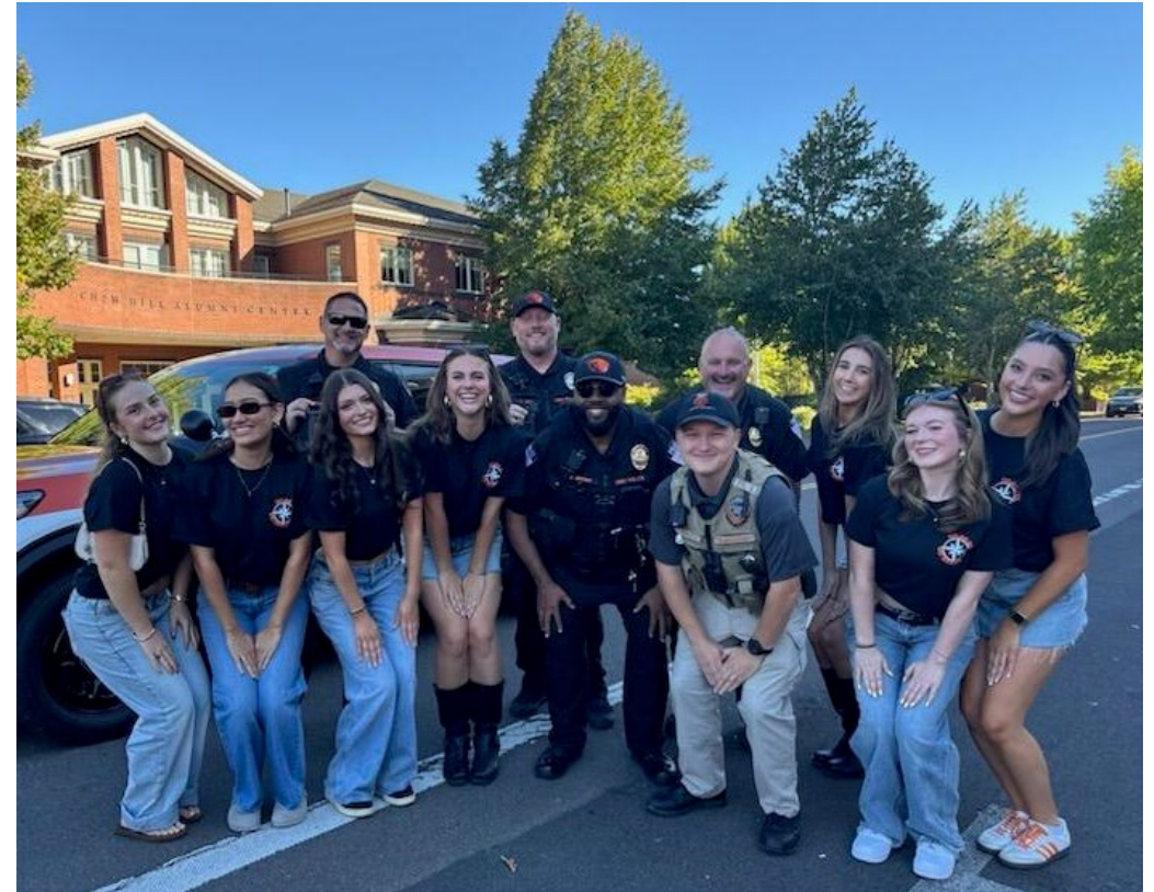
OSU Public Safety and Police Officers train together and build relationships with the community