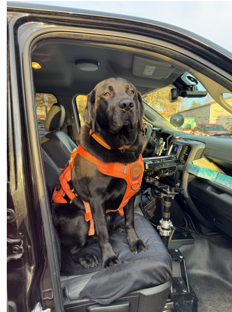
Cedar, the Wellness Dog prepares for work