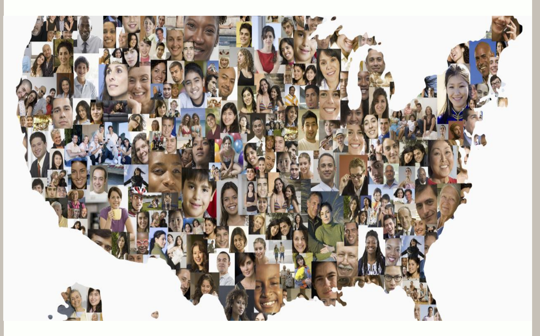
America by 2050